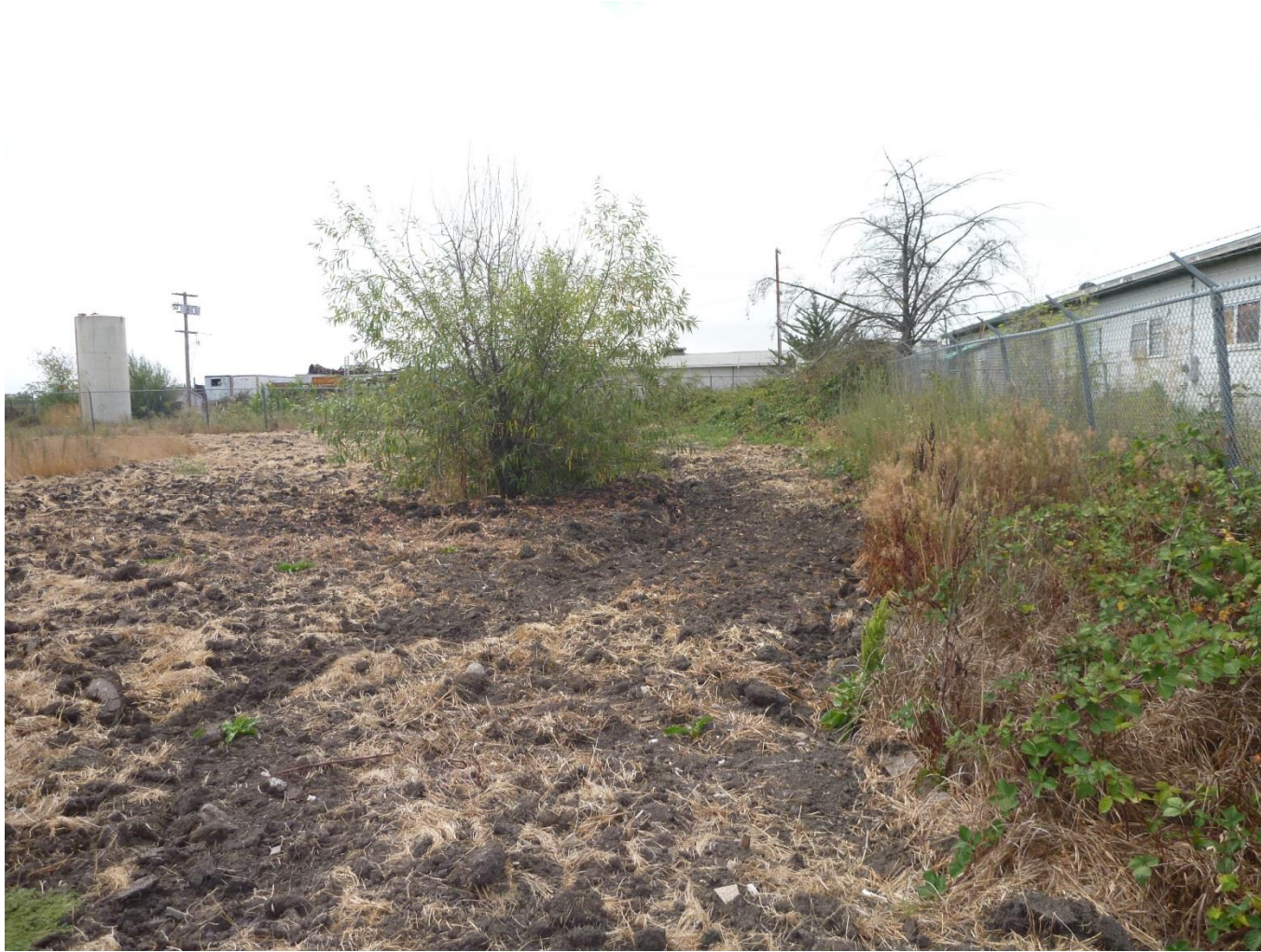
Figure 5. Wetland (disked) along west boundary, view south