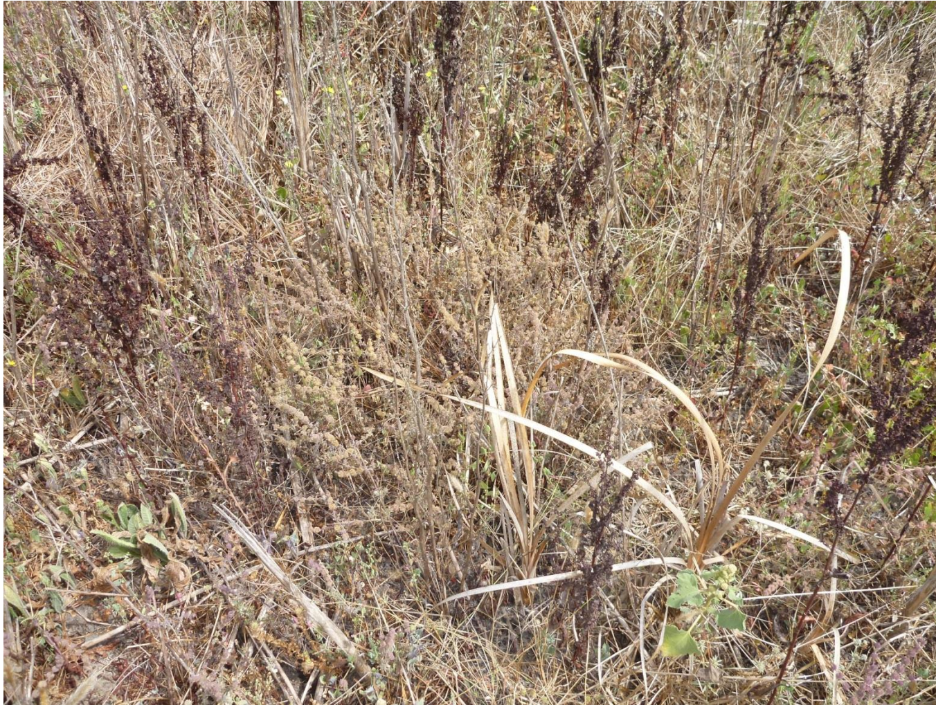
Figure 7. Closeup view of large interior wetland; visible are cattail, common cocklebur, pennyroyal, dock, bristly ox-tongue, and yellow star-thistle