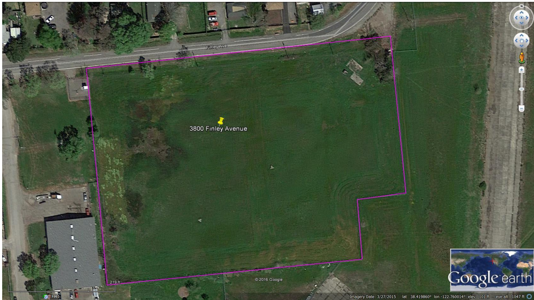
Figure 2. Aerial view of 3800 Finley Avenue parcel