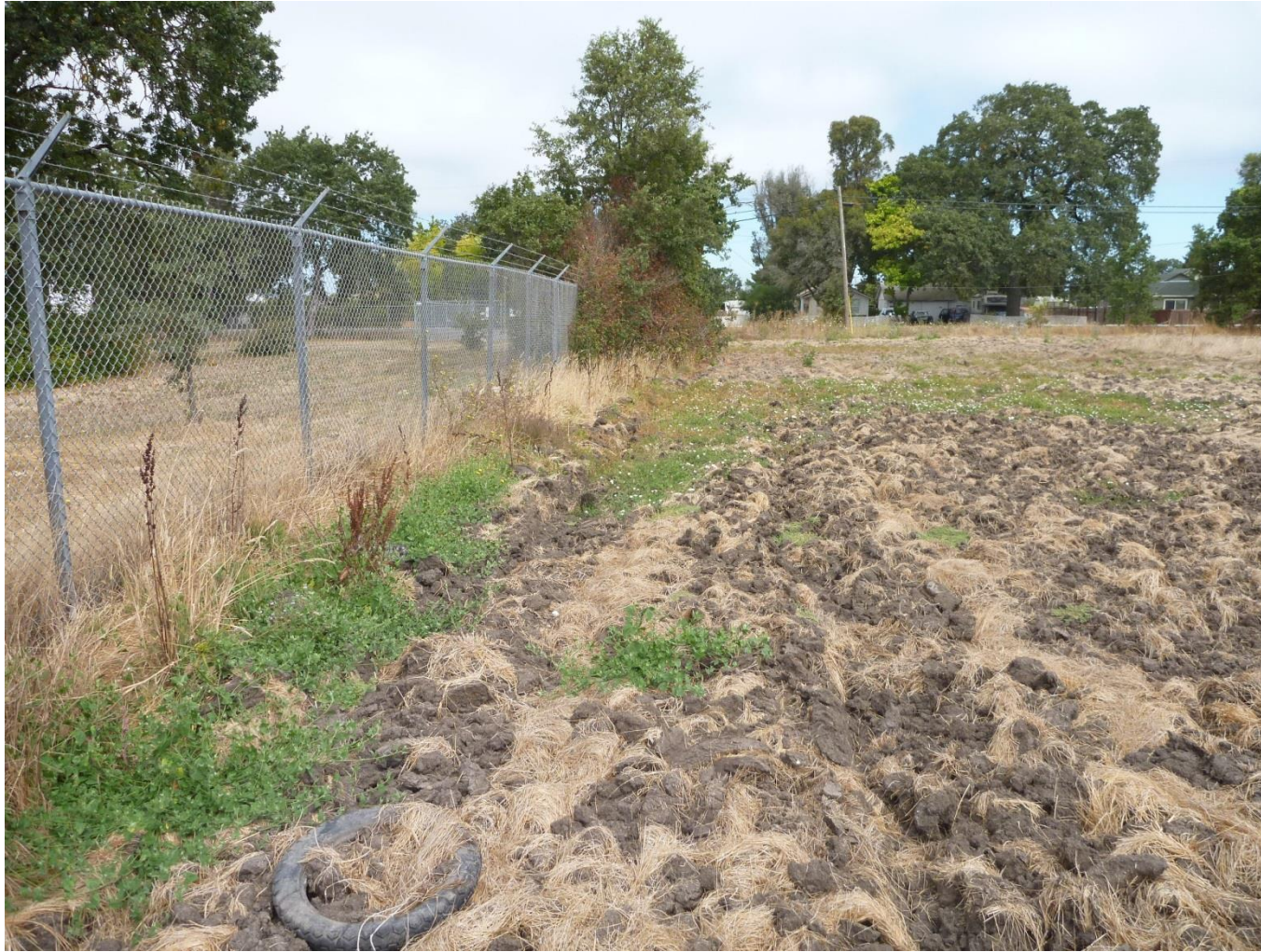
Figure 6. Wetland (disked) along west boundary, view north