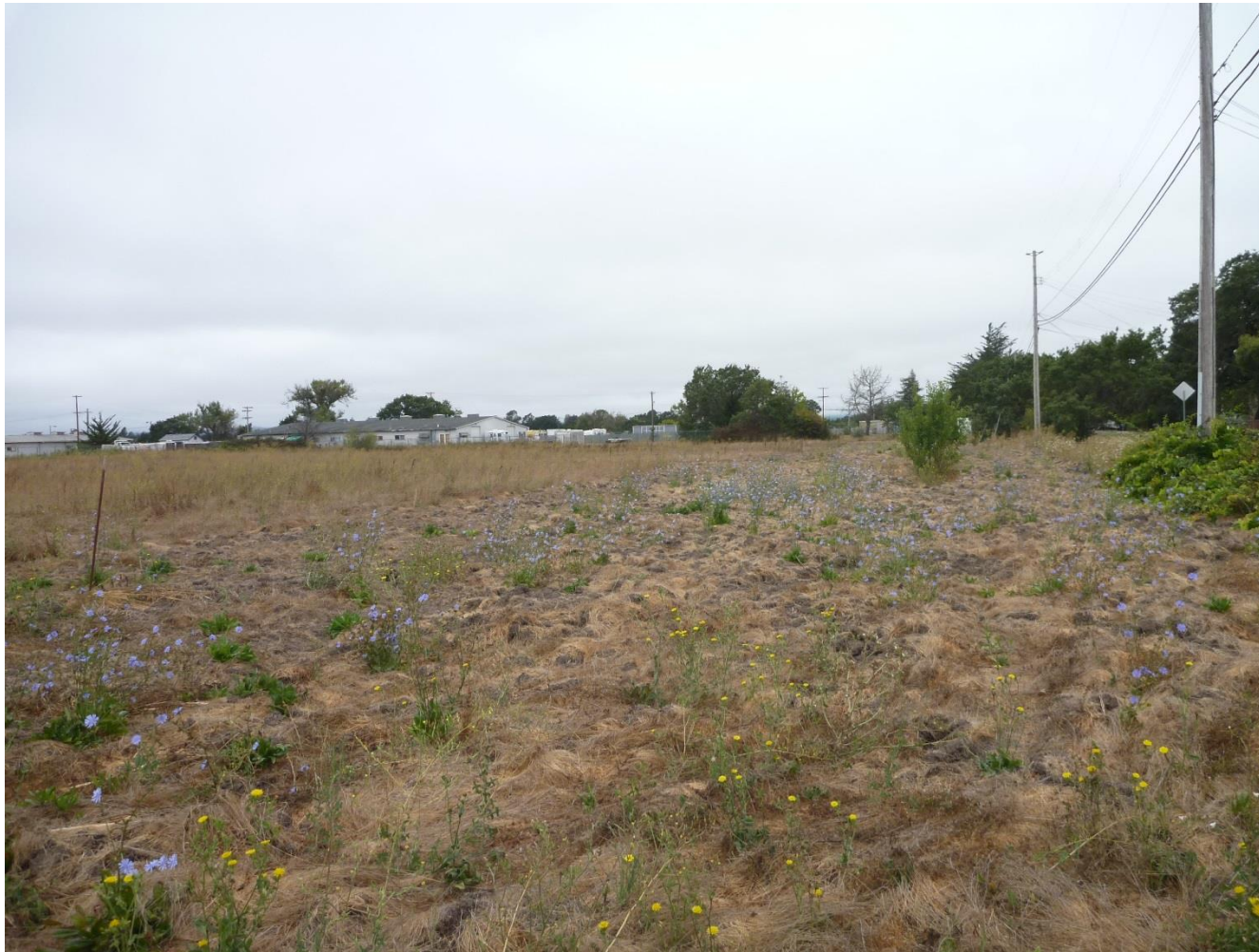
Figure 4. Diked 30-to-50-ft. fire break around perimeter of property---view west from northeast corner; undisked grassland on left